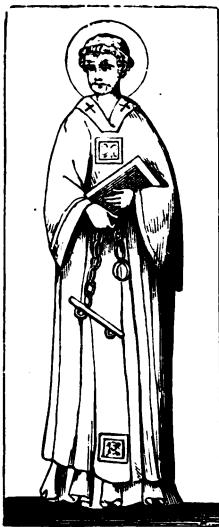
S. Leonard ( old fresco ).

oratory. Here he lived after the manner of hermits of his time, his food wild herbs and fruit, his time alternately devoted to prayer, meditation, the active succour of the sick and suffering, and occasional exhortation and preaching in the neighbouring churches ; and after a time, as so often